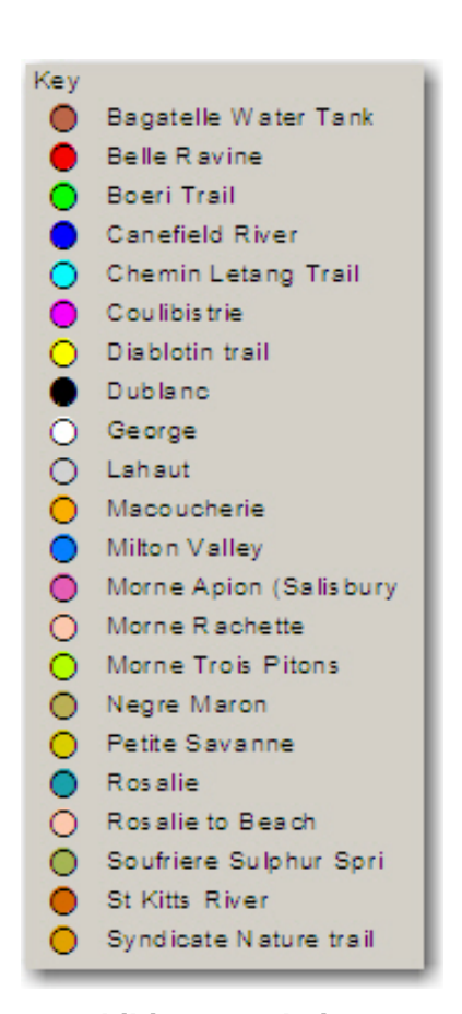
Figure 2. Map of Dominica illustrating the location of each of the amphibian population monitoring and chytridiomycosis surveillance transects.

Eleutherodactylid frogs remained common along all transects throughout the year, but four of the tree frogs swabbed from three transects gave positive results for Batrachochytrium dendrobatidis infection. These infected frogs had no outward evidence of disease, possibly indicating that tree frogs might be acting as reservoir species for Batrachochytrium dendrobatidis infection on Dominica.